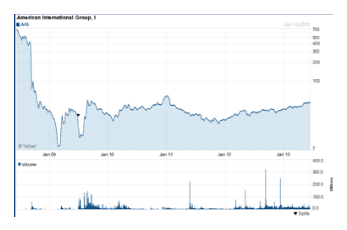
EXHIBIT 5 AIG Stock Never Became Valueless